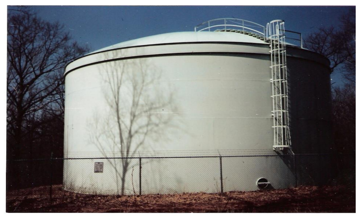
Contaminants that may be present in source water include:

land or through the ground, it dissolves naturally occurring minerals, and in some cases radioactive material and can pick up substances resulting from the presence of animals or from human activity.